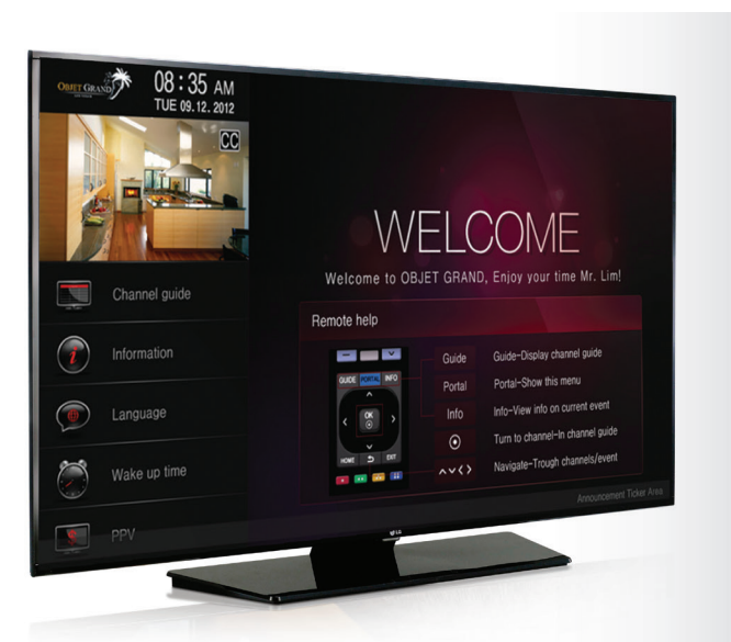
Full features are available when connected to the Pro:Centric® Server.

Now, you can manage your hotel more easily and efficiently with Pro: Centric® V Series helping your guests to have more comfortable and convenient experience in their hotel room. You can also operate all guest room TVs with centralized management on one system while saving cost and workforce.